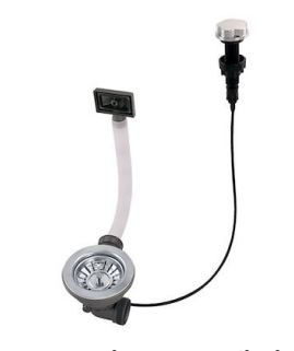
Automatic waste fitting 8407 100