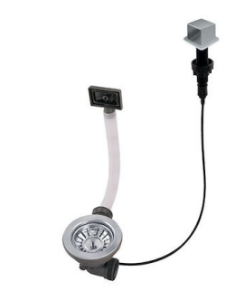
LIRA automatic waste fitting 8407 103